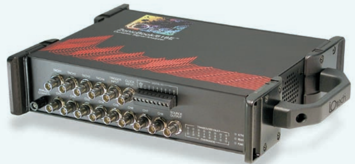
The ZonicBook/618E with eZ-Series software and your PC makes a real-time, portable vibration analysis monitoring system